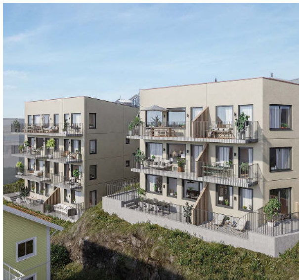
Sale of the remaining plots in Lysekil have resumed.

Two of the four plots in Lysekil were sold in 2025, and the sale of the remaining two plots has now resumed. The plots are located in the North Harbour in Lysekil and offer sweeping views of the sea. The aim is to sell the two remaining plots during H1 2026.