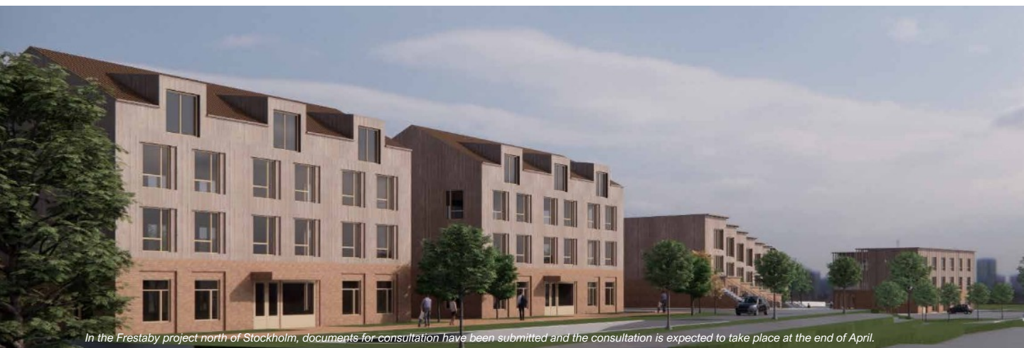
In the Frestaby project north of Stockholm, documents for consultation have been submitted and the consultation is expected to take place at the end of April.