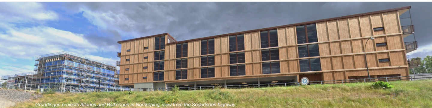
Grundingen projects Altanen and Bålkongen in Norrköping, view from the Söderleden highway.

Krook & Tjäder is working on updating development plans for the Tureholm project, including investigation of buildable areas. Once completed, the proposals will be presented to Trosa municipality. The plot is well suited for detached villas, chain houses or terraced houses. The plot is large and accommodates between 70-110 homes. The project will be divided into stages. Trosa municipality enjoys relatively high population growth.