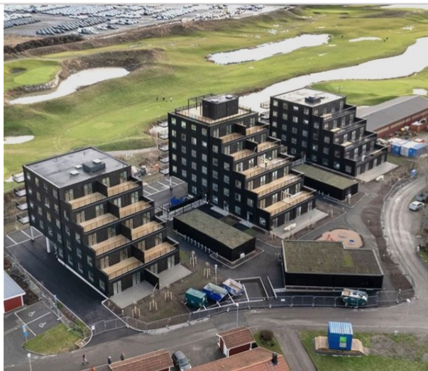
Torslanda Terrasser was completed during the quarter.

The final inspection with the municipality proceeded well and the building was approved resulting in that the tenants move into the building. Marketing regarding the 46 tenant apartments is ongoing. The Bastuban project is to be kept under Grundingen's own management.